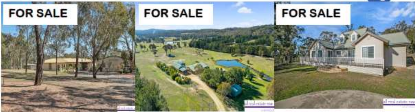
8 Proud Pl WAMBOIN